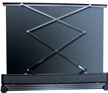
Back with scissor-action, stepless height adjustment