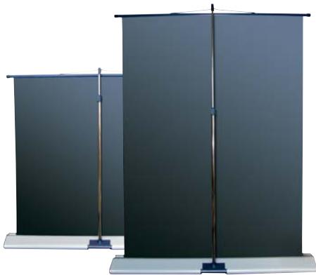
Back: stepless height adjustment