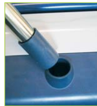
Back: simply insert the tripod pole