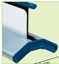
Modern, stylish design